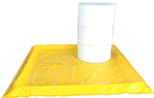
Hazero Spillpal – 4 Drum Square

If you are looking for a complete, portable containment unit – rather than a permanent and fixed barrier – then our Hazero Spillpal range might be an option worth considering. There are a number of standard configurations which you can view here . We can also supply custom made sizes of these if required.