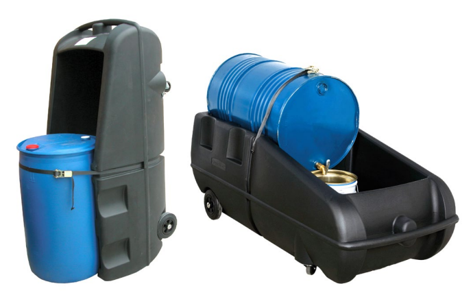
Hazero Drum Trolley

Featuring a u-shaped drum platform, the Hazero Drum Trolley is not only a useful tool for transporting drums, but it also has the ability to act as a safe decanting station, all the while providing a massive 250 litres of spill containment capacity – more than the entire contents of the whole drum.