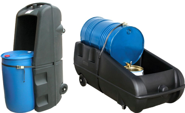
Hazero Drum Trolley

Featuring a u-shaped drum platform, the Hazero Drum Trolley is not only a useful tool for transporting drums, but it also has the ability to act as a safe decanting station, all the while providing a massive 250 litres of spill containment capacity – more than the entire contents of the whole drum.