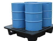
Spill Pallet - 4 Drum 01-1021