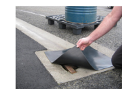
Drain Protector - Nitrile Small: 22-1012 Large: 22-1013