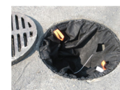
Storm Sentinel - Round 22-1010