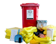
Mobile Spill Kit - Aggressive 100L: 13-1005 200L: 13-1002