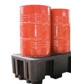
Spill Pallet - 2 Drum 01-1020