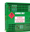
Aerosol Store - 180 can 04-1109