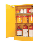
Flammable Cabinet - 250L 04-1067