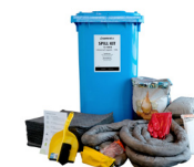
Mobile Spill Kit - Universal 100L: 13-1004 200L: 13-1001