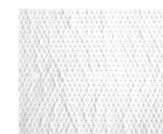
Sorbent Pad - Oil Only - Light Weight 06-1000