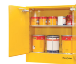
Flammable Cabinet - 160L 04-1066