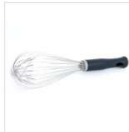
MONDO PRO PIANO WHISK 30CM