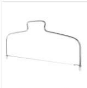
MONDO CAKE LEVELER 32CM