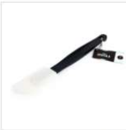
MONDO PRO SPATULA 25CM