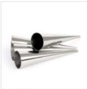
MONDO CREAM HORN MOULDS 4 PC S/S