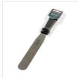
MONDO STRAIGHT SPATULA 8IN/20CM