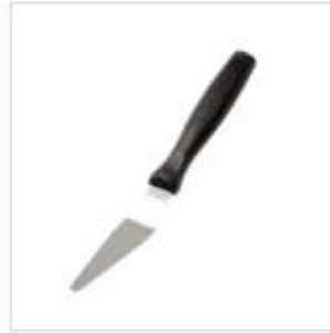
Pointed /Angled Spatula