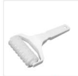
MONDO LATTICE CUTTER 120MM WIDE