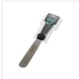
MONDO STRAIGHT SPATULA 6in/15cm