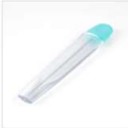
MONDO CAKE TESTER