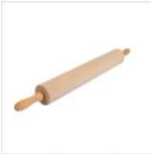
ROLLO #25 ROLLING PIN MED 6X25CM