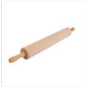
ROLLO ROLLING PIN LGE 6.5X45CM