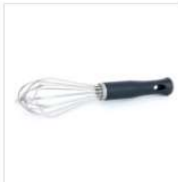
MONDO PRO FRENCH WHISK 25CM