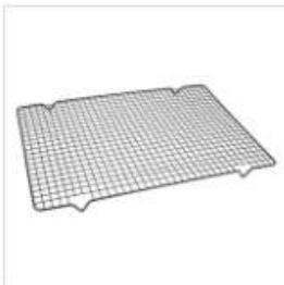
CAKE COOLING RACK