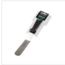
MONDO CRANKED SPATULA 6in/15cm