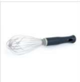
MONDO PRO PIANO WHISK 25CM