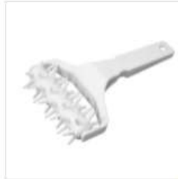
MONDO ROLLER DOCKER 110MM WIDE