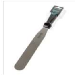
MONDO STRAIGHT SPATULA 10IN/25.5CM