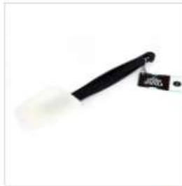
MONDO PRO SPOON SPATULA 25CM