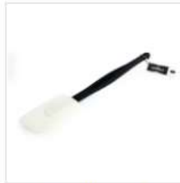
MONDO PRO SPATULA 35CM