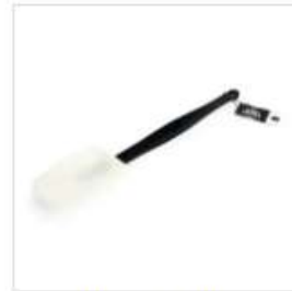
MONDO PRO SPOON SPATULA 35CM