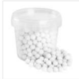
CERAMIC PIE WEIGHTS