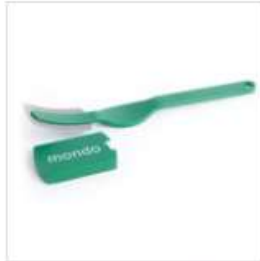
MONDO BREAD LAME WITH PLASTIC HANDLE