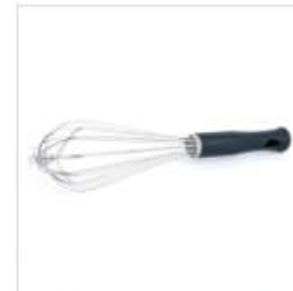
MONDO PRO FRENCH WHISK 30CM