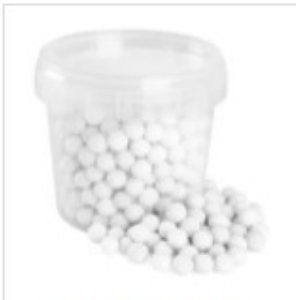
MONDO CERAMIC PIE WEIGHTS 500G