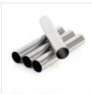
CANNOLI TUBE / MOULD

For all product enquires, quotes, sales and service, please contact Mayfair Australia on sales@mayfairco.com.au