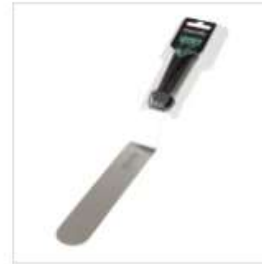
MONDO CRANKED SPATULA 10IN/25.5CM