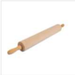
WOODEN ROLLING PIN - ROLLO