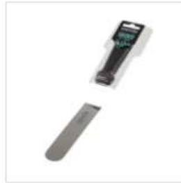
MONDO CRANKED SPATULA 8IN/20CM