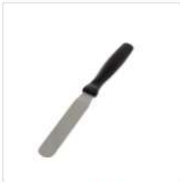
MONDO STRAIGHT SPATULA 4.5IN/11.5CM