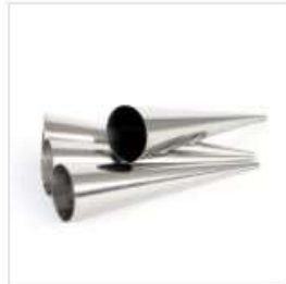
CREAM HORN MOULDS