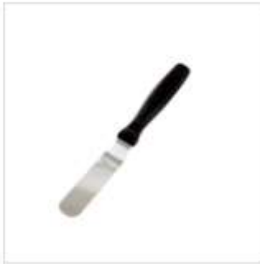
MONDO CRANKED SPATULA 4.5IN/11.5CM