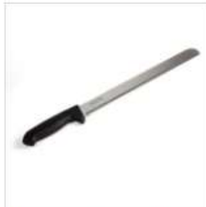
MONDO PROF CAKE KNIFE 35CM/14inch