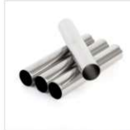
CANNOLI TUBE / MOULD