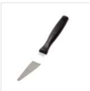
MONDO ANGLED / POINTED SPATULA 4IN