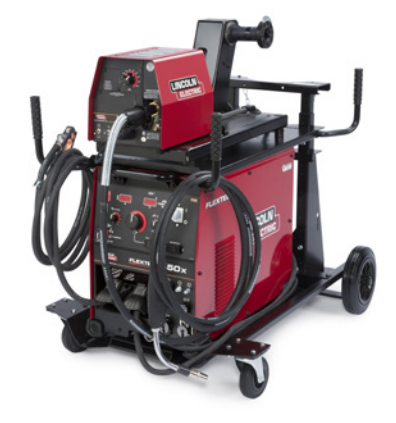
K3512-1 Flextec 650X/LF-74 Heavy Duty Ready-Pak®