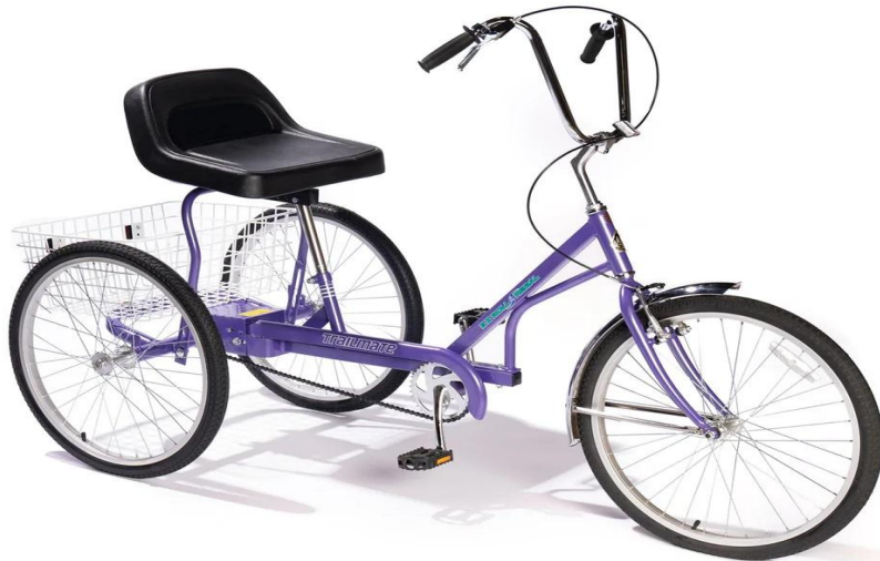
EZ ROLL REGAL