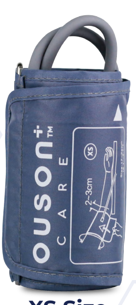
XS Size 17-22 CM (Model No. : OC-XS-1722)