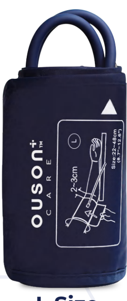
L Size 22-48 CM (Model No. : OC-L-2248)