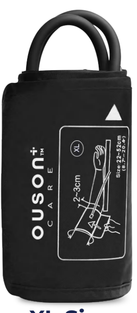
XL Size 22-52 CM (Model No. : OC-XL-2252)