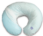
Boppy® Healthcare Feeding Pillow 2 PK 2/Case