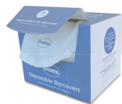
Boppy® Disposable Slipcover 48/Case