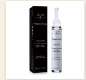
Firming Eye Cream