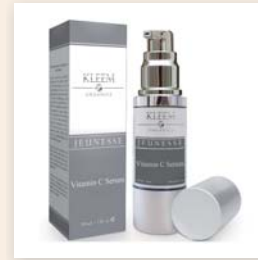
Vitamin C Serum