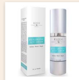
Hyaluronic Acid Serum