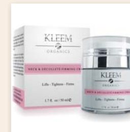
Neck Firming Cream