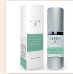
Dark Spot Removing Serum