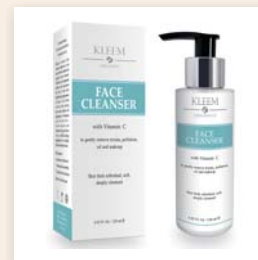
Vitamin C Cleanser