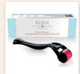
Microneedle Derma Roller