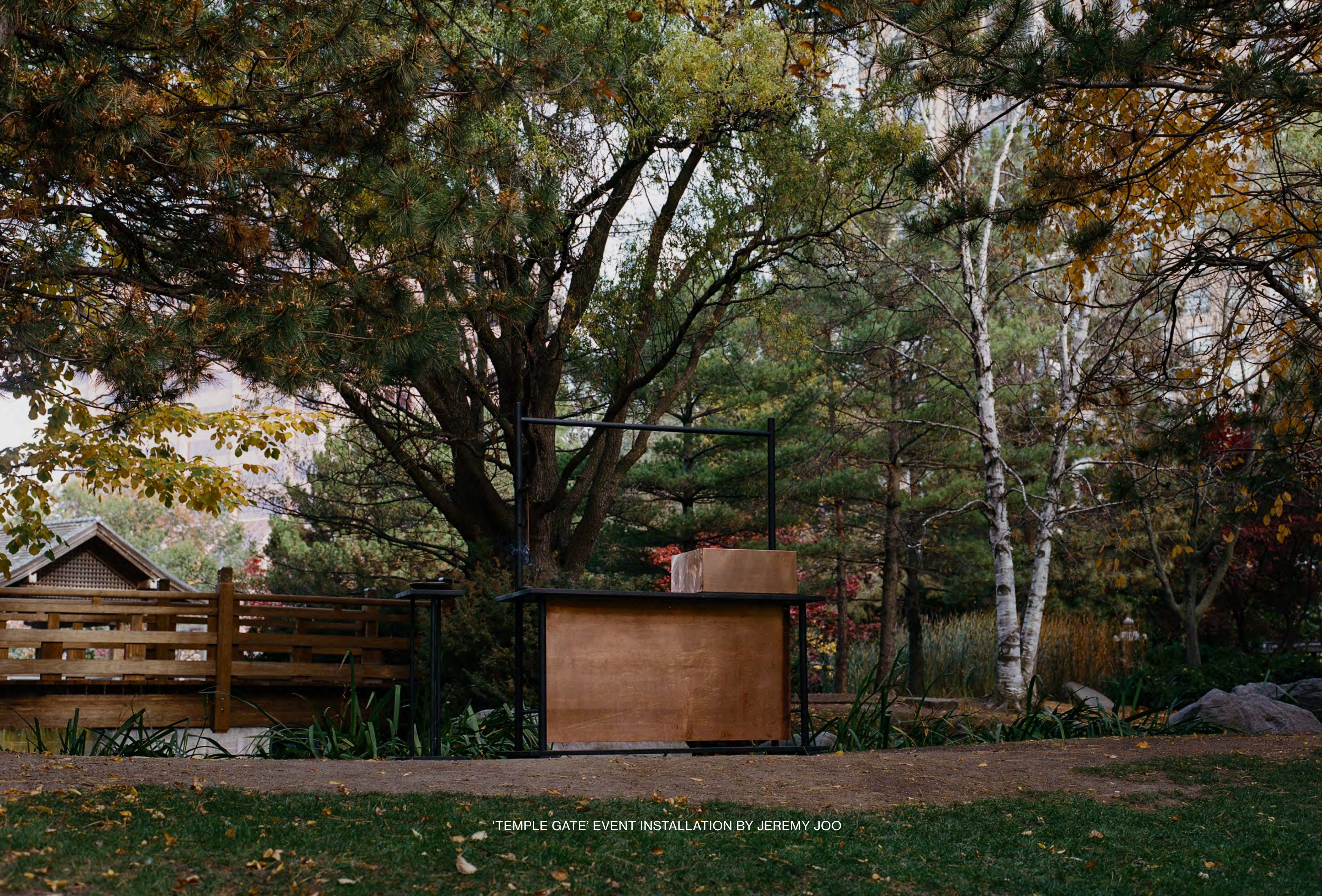
'TEMPLE GATE' EVENT INSTALLATION BY JEREMY JOO