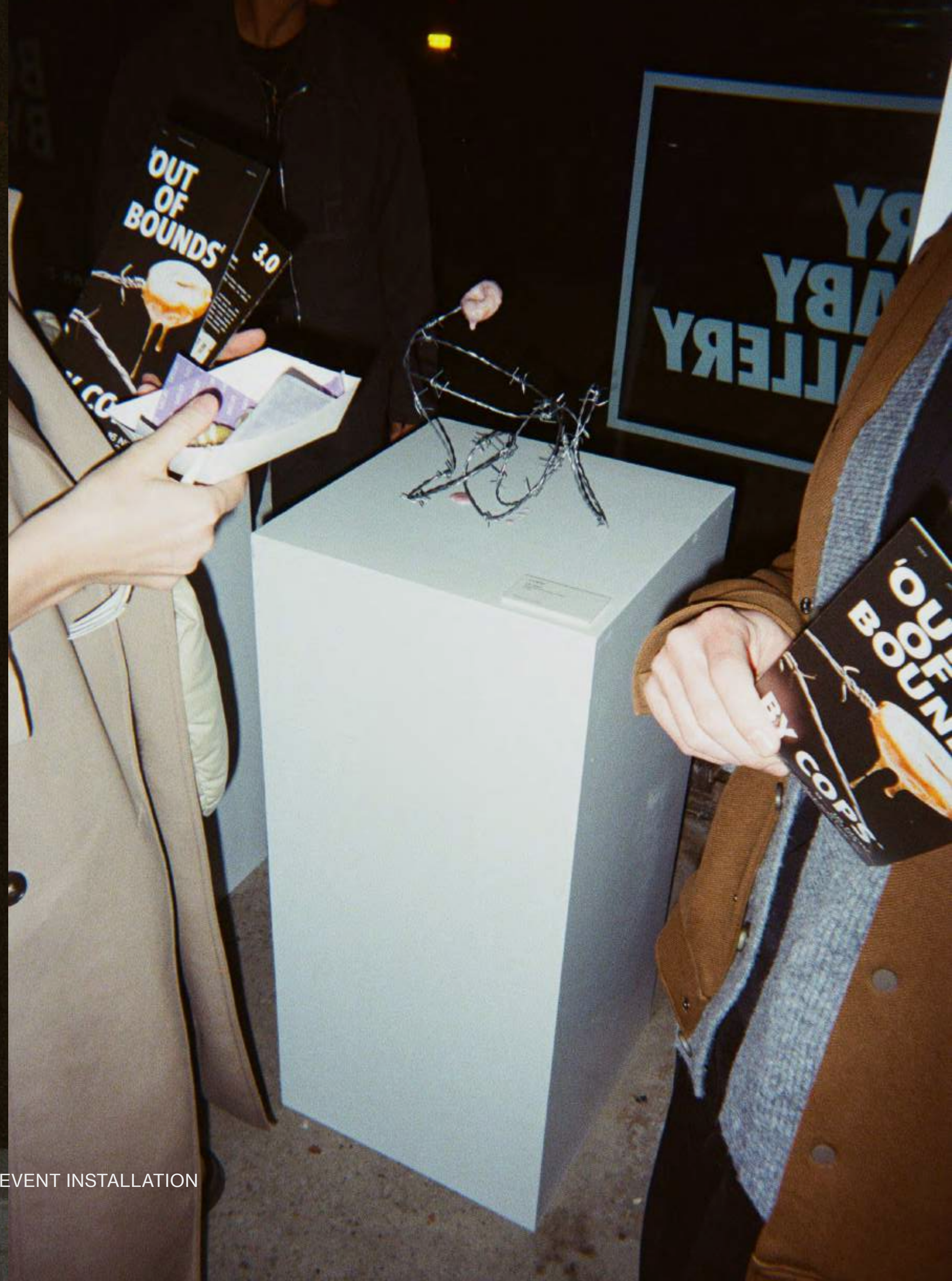
COPS "Old Fashioned" Old Cheese Available at the White Gallery 0411 222 2222 COPERS, BOSTON