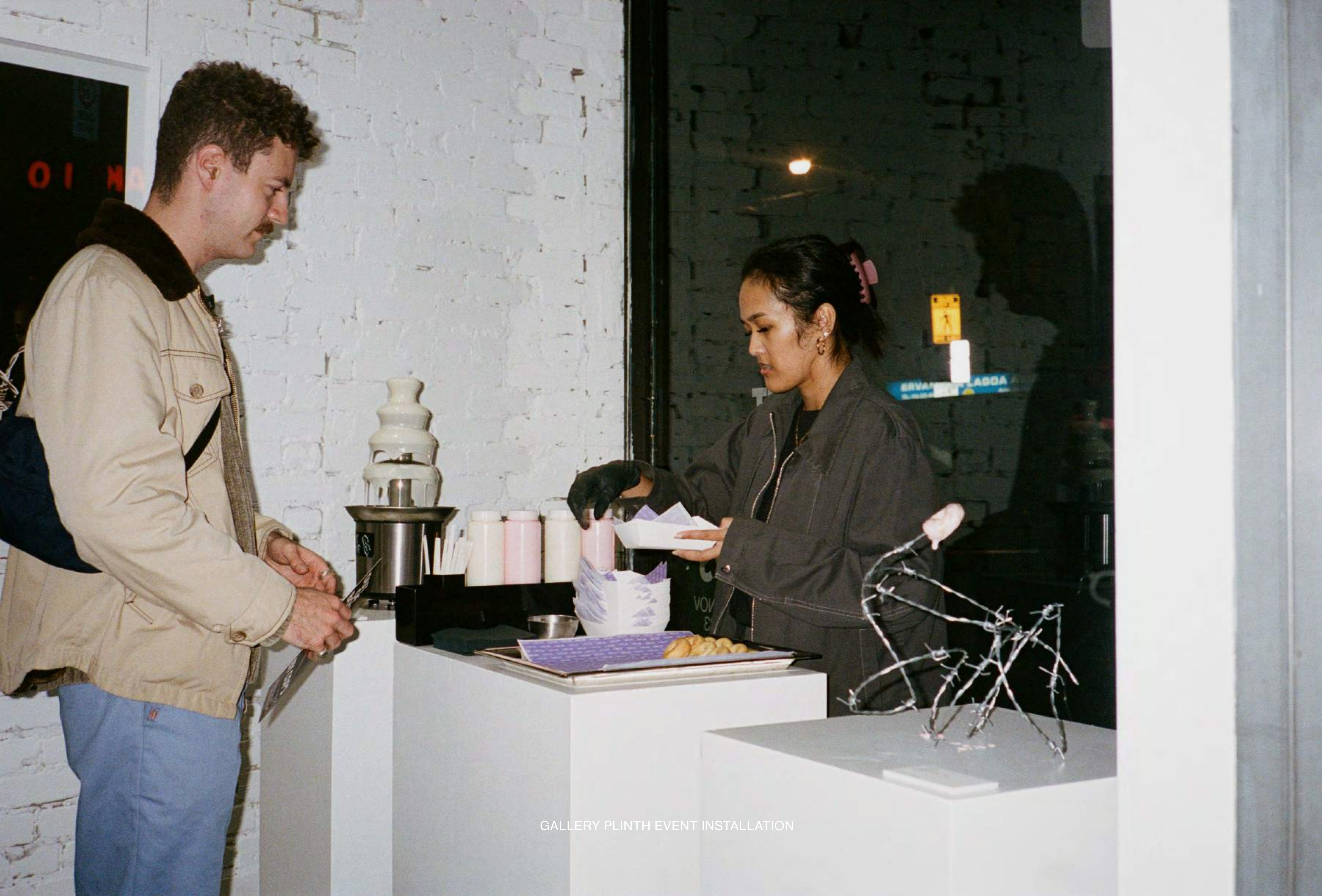
GALLERY PLINTH EVENT INSTALLATION