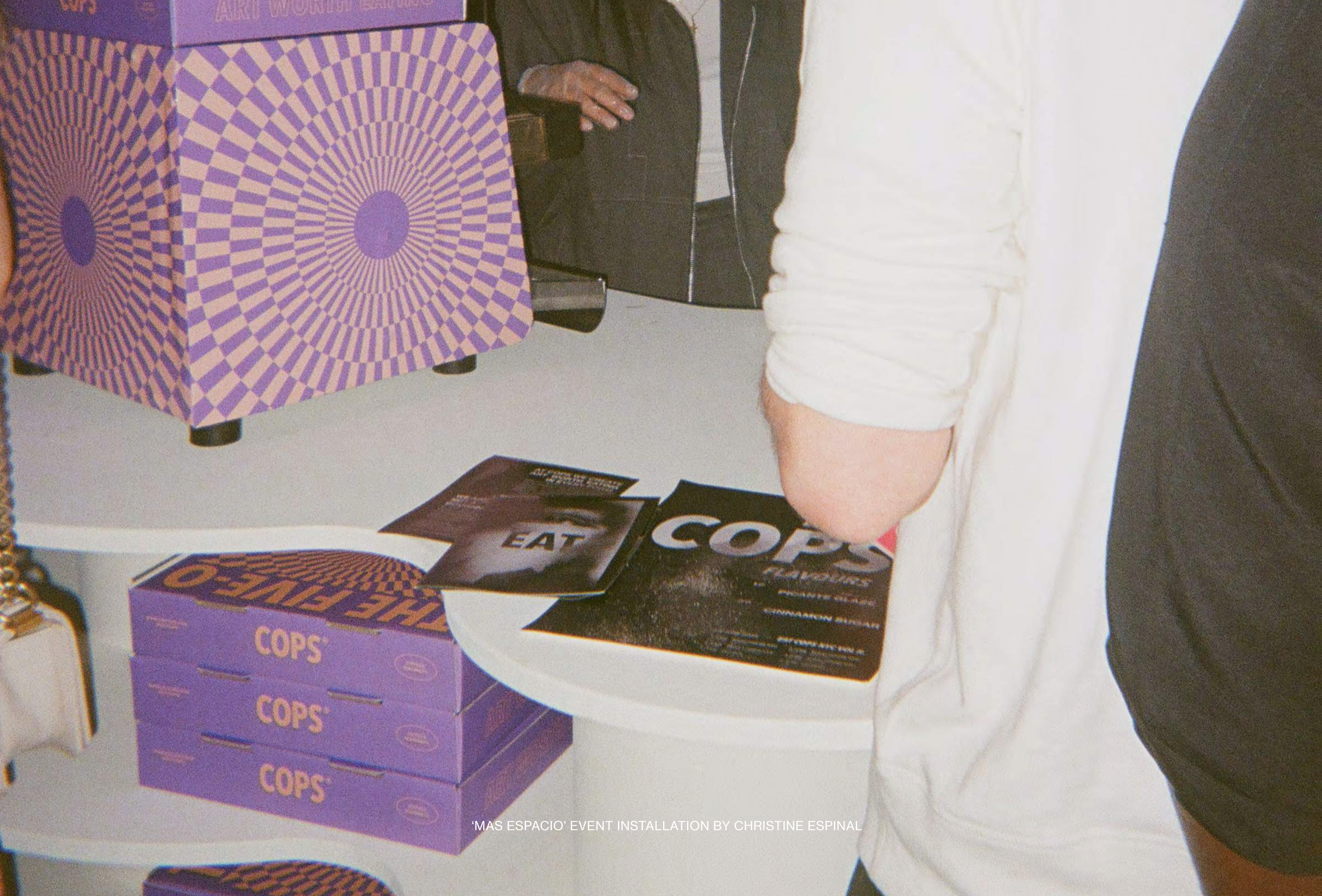
'MAS ESPACIO' EVENT INSTALLATION BY CHRISTINE ESPINAL