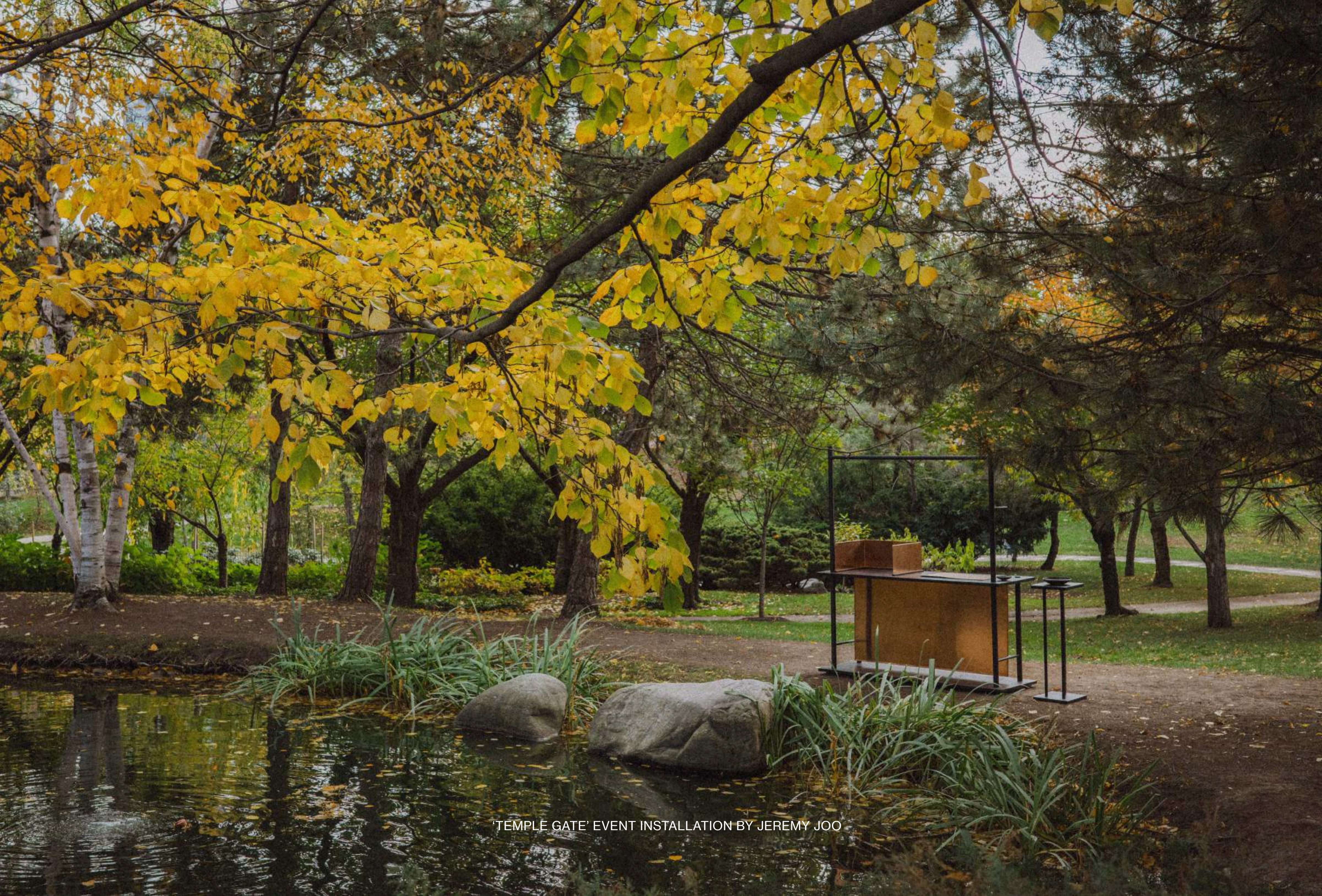
'TEMPLE GATE' EVENT INSTALLATION BY JEREMY JOO