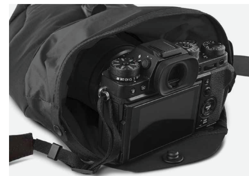
FOR USE WITH EXISTING CAMERA STRAP