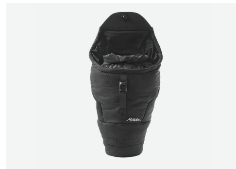
WATERPROOF ROLLTOP DRYBAG INSIDE