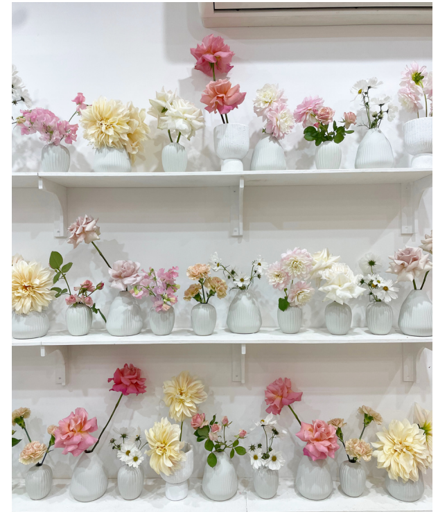
*images 1, 5 are inspiration gathered from Pinterest for style or size reference only

THEN we love to add in gorgeous elements like candles, linens, textural vases & you've got yourself a dreamy romantic tablescapes