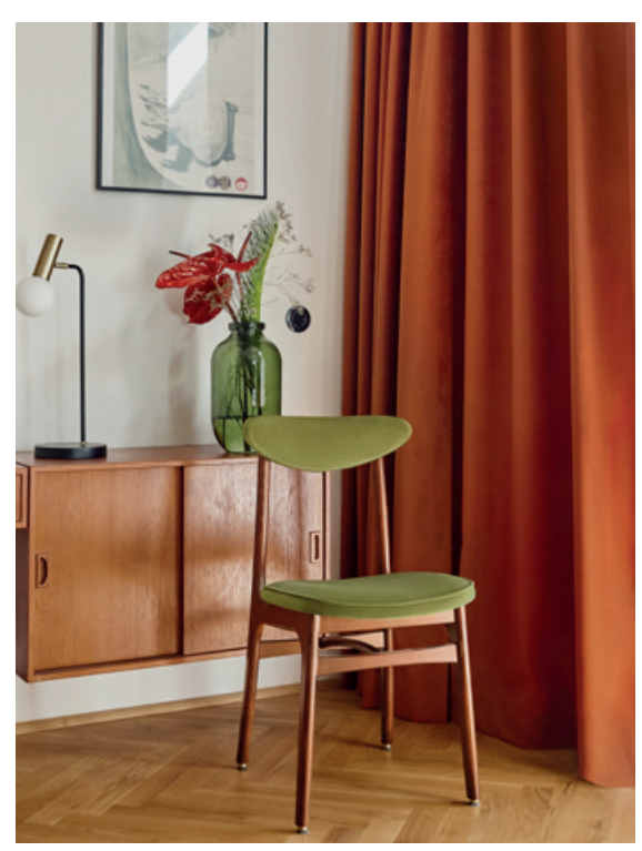
Velvet Coll. - Sierra