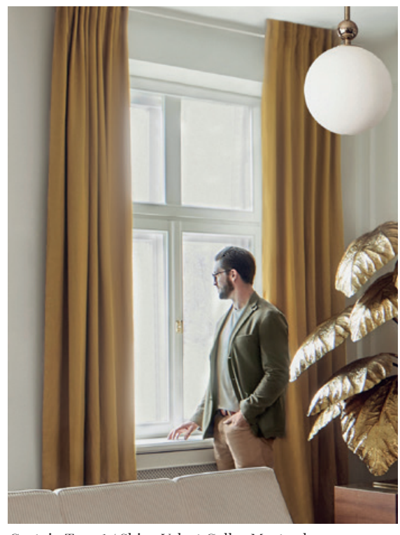
Curtain Type 1 / Shine Velvet Coll. - Mustard

100% designed and manufactured in Poland