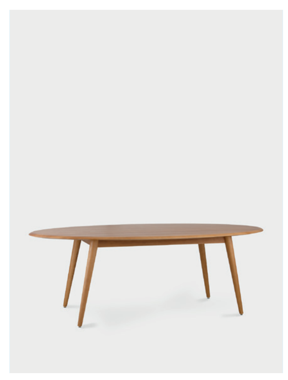
Table Ellipse / Oak 03