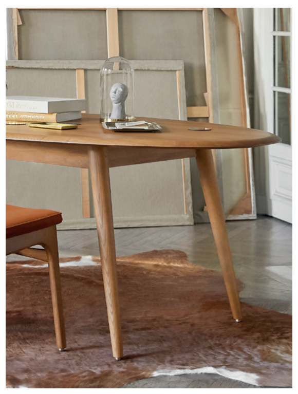
Table Ellipse / Oak 03

100% designed and manufactured in Poland