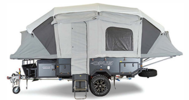
Aerial view with annexe & roof rack installed