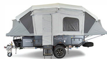
Aerial view with annexe & roof rack installed