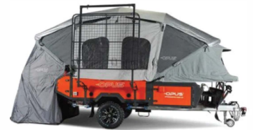
Aerial view with annexe & roof rack installed