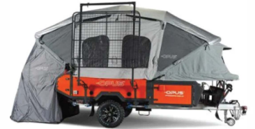
Aerial view with annexe & roof rack installed