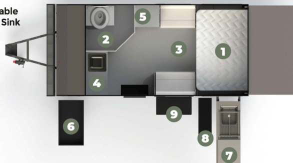
FLOOR PLAN SHOWN: OPTION ONE