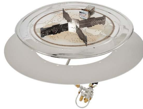
BURNER INSERT AND PLATE