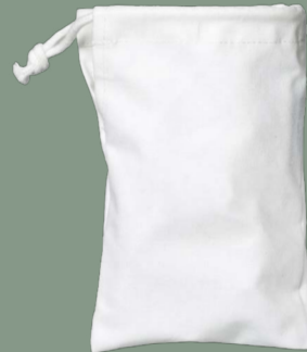
Drawstring Bag Small 1-side opening Width 11 cm Height 17 cm