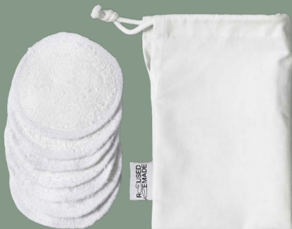
Makeup Pads & Drawstring Bag Width 11 cm Bag Height 17 cm Pads 8 cm in diameter