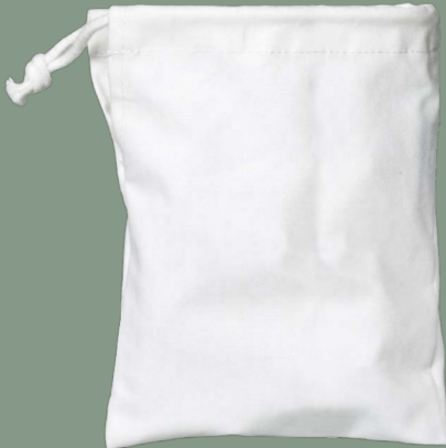
Drawstring Bag Medium 1-side opening Width 30 cm Height 40 cm