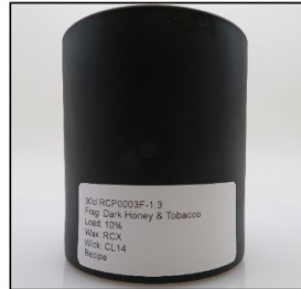
Before Burn Front - Sample 3