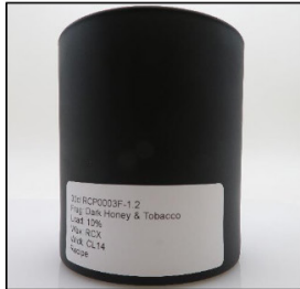
Before Burn Front - Sample 2