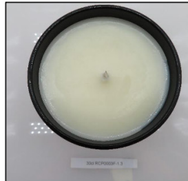
Before Burn Top - Sample 3