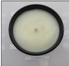
Before Burn Top - Sample 2