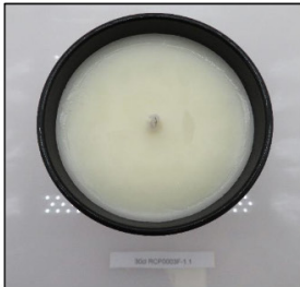
Before Burn Top - Sample 1