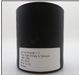
Before Burn Front - Sample 1