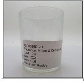
End of Burn Front - Sample 1