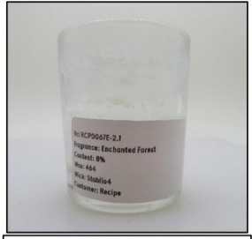
End of Burn Front - Sample 1