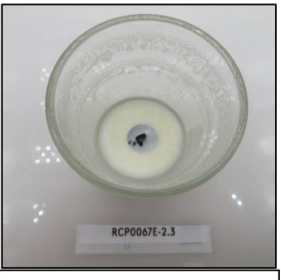
End of Burn Top - Sample 3