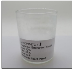
End of Burn Front - Sample 1