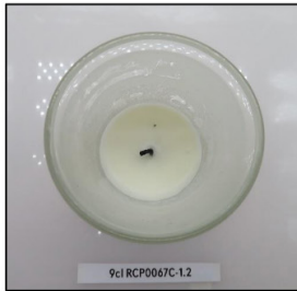
End of Burn Top - Sample 2