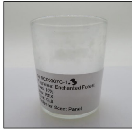
End of Burn Front - Sample 3