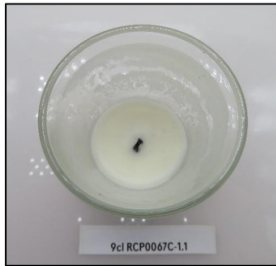
End of Burn Top - Sample 1