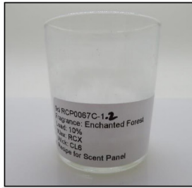
End of Burn Front - Sample 2