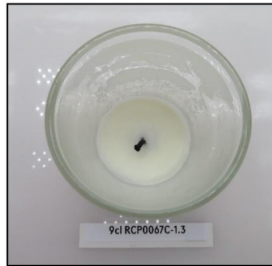
End of Burn Top - Sample 3