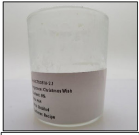
End of Burn Front - Sample 1