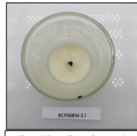
End of Burn Top - Sample 1