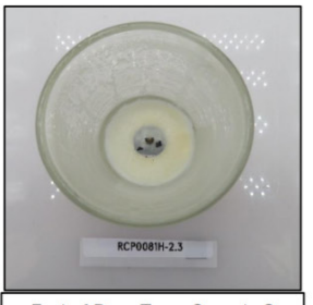
End of Burn Top - Sample 3