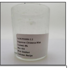
End of Burn Front - Sample 2