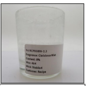
End of Burn Front - Sample 3