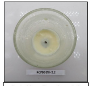
End of Burn Top - Sample 2