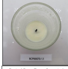
End of Burn Top - Sample 1