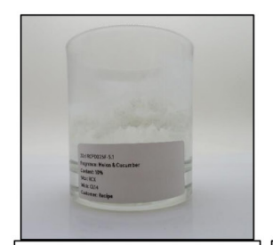
End of Burn Front - Sample 1