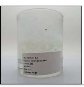
End of Burn Front - Sample 2