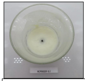
End of Burn Top - Sample 1