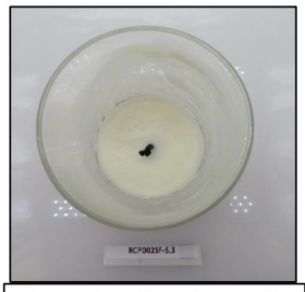
End of Burn Top - Sample 3