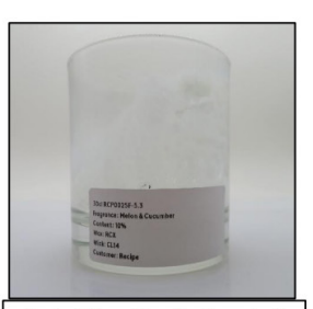
End of Burn Front - Sample 3