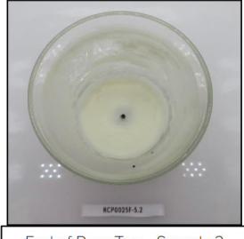
End of Burn Top - Sample 2