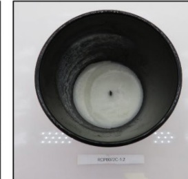
End of Burn Top - Sample 2