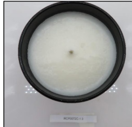
Before Burn Top - Sample 3