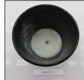
End of Burn Top - Sample 1