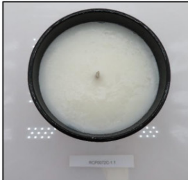
Before Burn Top - Sample 1