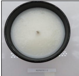
Before Burn Top - Sample 2