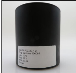
Before Burn Front - Sample 2