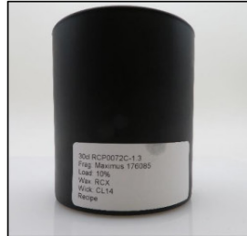
Before Burn Front - Sample 3