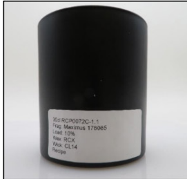
Before Burn Front - Sample 1