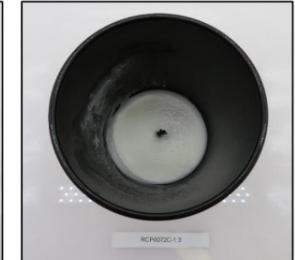
End of Burn Top - Sample 3