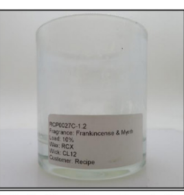
End of Burn Front - Sample 2