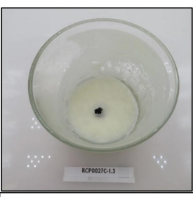
End of Burn Top - Sample 3