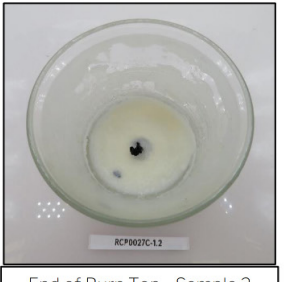
End of Burn Top - Sample 2