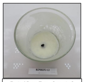
End of Burn Top - Sample 3