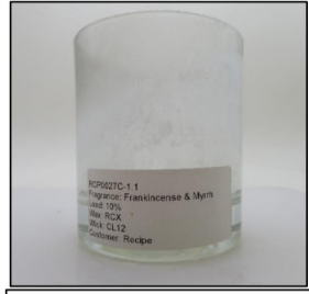
End of Burn Front - Sample 1