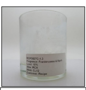
End of Burn Front - Sample 3