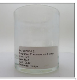
End of Burn Front - Sample 2