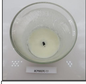
End of Burn Top - Sample 1