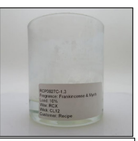
End of Burn Front - Sample 3