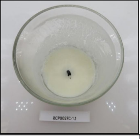
End of Burn Top - Sample 1