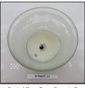
End of Burn Top - Sample 2