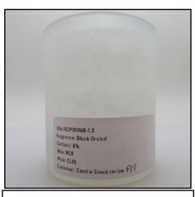
End of Burn Front - Sample 3