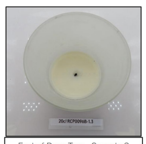
End of Burn Top - Sample 3