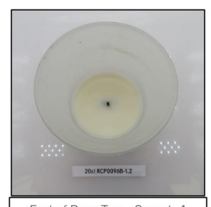
End of Burn Top - Sample 1