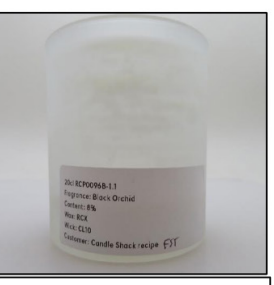
End of Burn Front - Sample 2