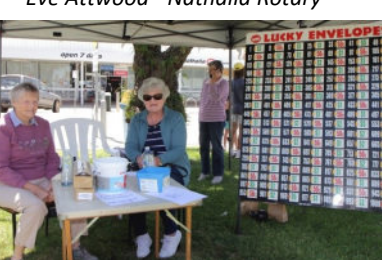
Nathalia Golf Club