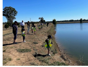
All the keen anglers with their lines in the water.