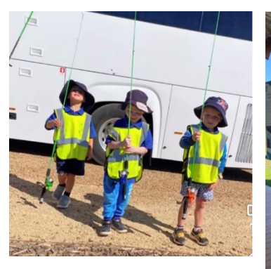
Rods at the ready, waiting patiently to walk to the dam.

The children and educators from Barmah Kindergarten and Nathalia Preschool headed off to Arcadia Native Fish Visitor Centre to try their luck at catching native fish. Every keen angler has the wish of catching a Murray Cod, Yellow Belly, or a Silver Perch. Although not their day to catch anything, the educators are observing how their skills are increasing with their