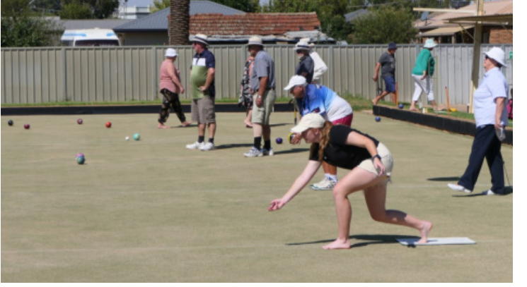
Good Friday Bowlers in action.

The Club is holding a Fashion Parade on Tuesday 9<sup>th</sup> April and a Trivia Night on Saturday 20<sup>th</sup> April. All welcome. Come along and have some fun and the Annual General Meeting is at the Club on 30<sup>th</sup> April at 7pm.