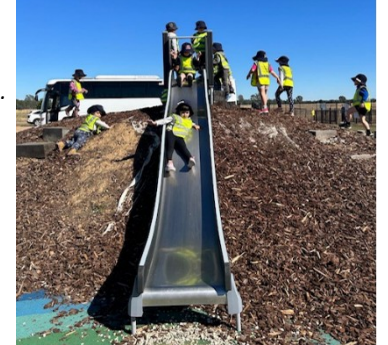
The children exploring the playground.