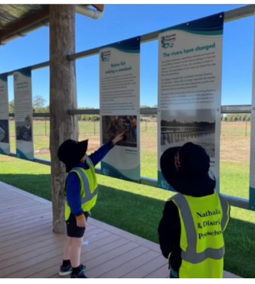
'Reading" the information boards this is the children's emerging literacy awareness

practice of casting and how their patience is extending as they wait for the elusive tug of the fishing line. The ability to make safe and positive choices and caring for others in the group. The preschools will join together at the beginning of term 2 for their next big adventure. To where, well you will have to wait for the next edition of the Red Gum Courier!