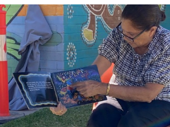
How did the birds get their colour?