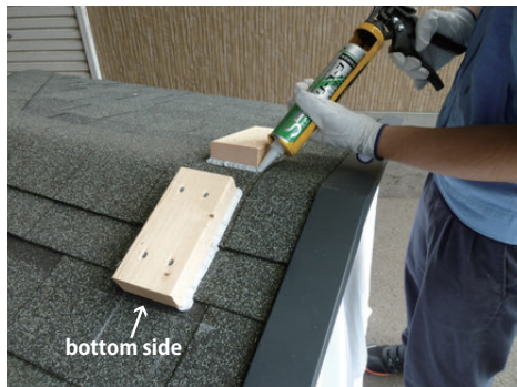
7. Caulk around the 3 sides of wood, and do not caulk the bottom side. The bottom side will let the rain go through.