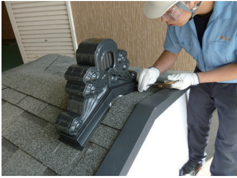
9. Make 6 guide holes on the front side and another 6 guide holes on the back side of B-compact. Those are for 1in.-screws to pierce through the wood.