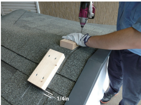
6. Attach the two pieces of wood to the roofs securely with screws. As you see on the picture, please place them about 1/4 in. above the bottom lines. This will prevent the wood from soaking rain.