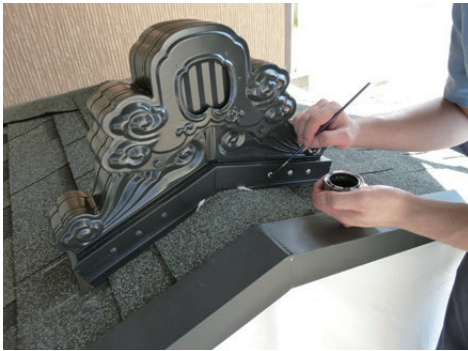
12. Use the touch-up paint that comes with B-compact, and paint the head of the screws.

Only for galvalume steel sheet products from here