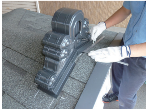
4. Outline the FB-9in so that you know where exactly it will be placed.