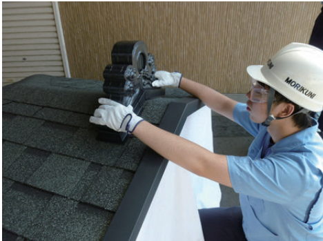
3. Find a place on the roof where FB-9in can sit stable without leaning.