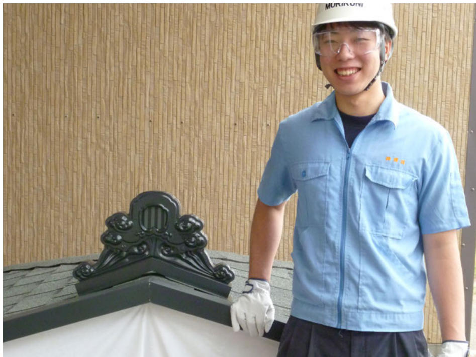
FINISH Please wear a helmet, goggles, gloves and safety belt to work safely and efficiently at high working site.