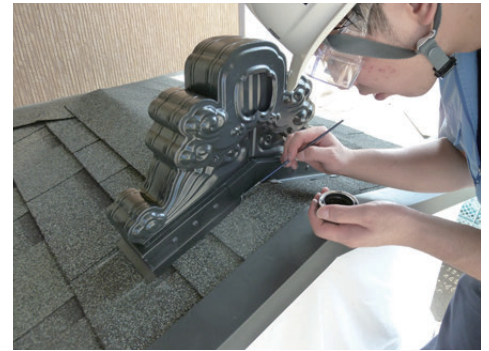
14. Paint the caulking as well.