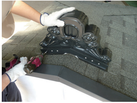
10. Screw 6 1in. screws on the front.