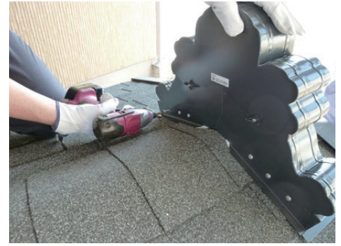
11. Screw 6 1in. screws on the back.

Only for galvalume steel sheet products from here