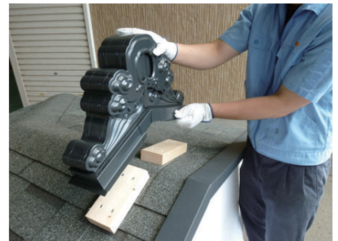
8. Cover FB-9in on those attached wood and make sure FB-9inis exactly where you drew the lines.