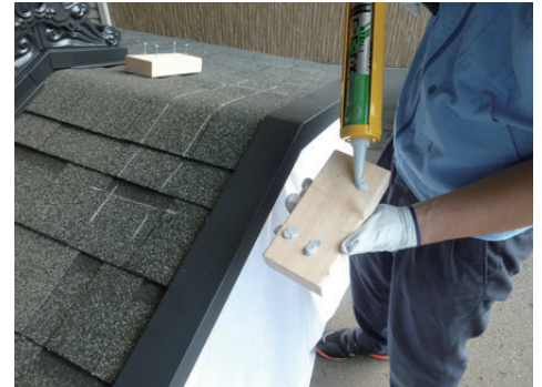
5. Drill four 3in.-screws only a half way on each pieces of wood and caulk the tip of the screws. This will prevent leaking of rain by the screw holes.