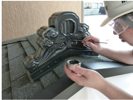
13. Paint any scratches from setting B-compact with the touch-up paint.