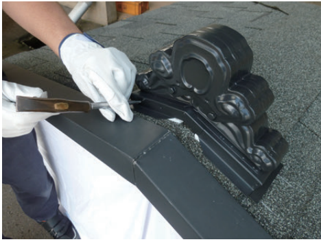
9. Make 4 guide holes on the front side and another 4 guide holes on the back side of B-mini. Those are for 1in.-screws to pierce through the wood.