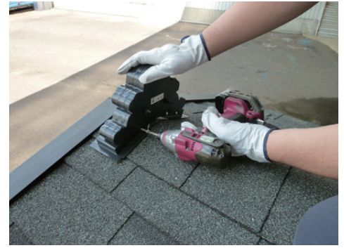
11. Screw 4 1in. screws on the back.

Only for galvalume steel sheet products from here