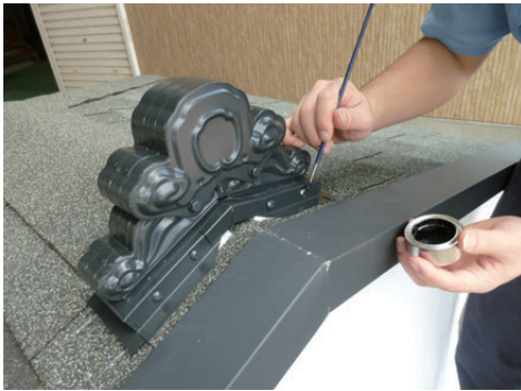
12. Use the touch-up paint that comes with B-mini, and paint the head of the screws.

Only for galvalume steel sheet products from here