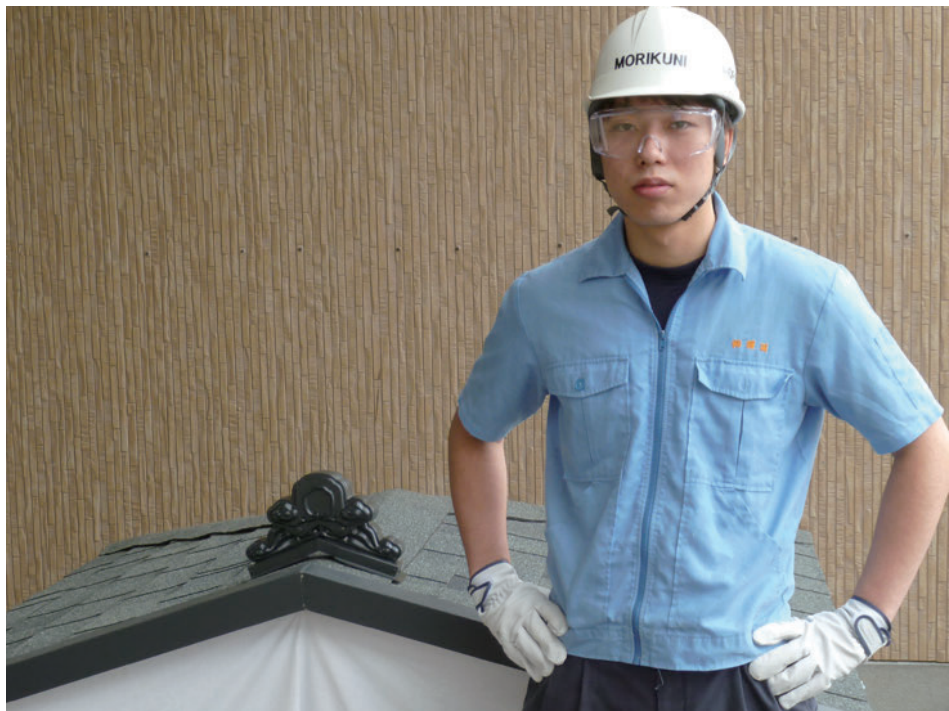
FINISH Please wear a helmet, goggles, gloves and safety belt to work safely and efficiently at high working site.