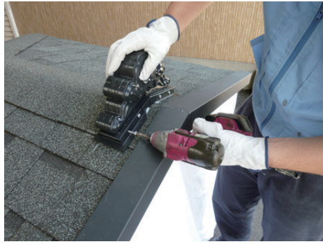
10. Screw 4 1in. screws on the front.