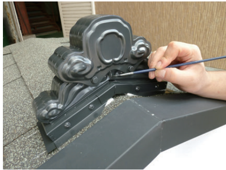
13. Paint any scratches from setting B-mini with the touch-up paint.