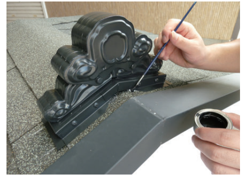
14. Paint the caulking as well.