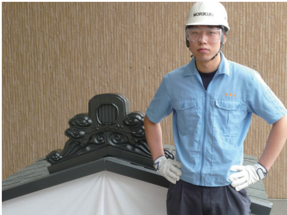
FINISH Please wear a helmet, goggles, gloves and safety belt to work safely and efficiently at high working site.