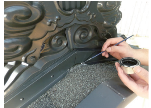
14. Paint the caulking as well.