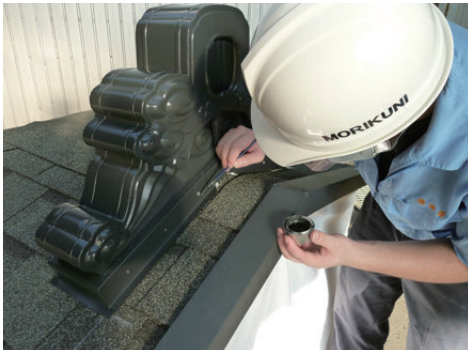
12. Use the touch-up paint that comes with B-12, and paint the head of the screws.

Only for galvalume steel sheet products from here