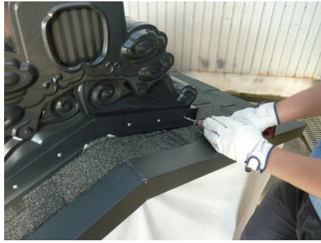
10. Screw 6 1in. screws on the front.