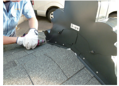
11. Screw 6 1in. screws on the back.

Only for galvalume steel sheet products from here