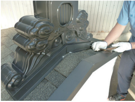
9. Make 6 guide holes on the front side and another 6 guide holes on the back side of B-12. Those are for 1 in.-screws to pierce through the wood.