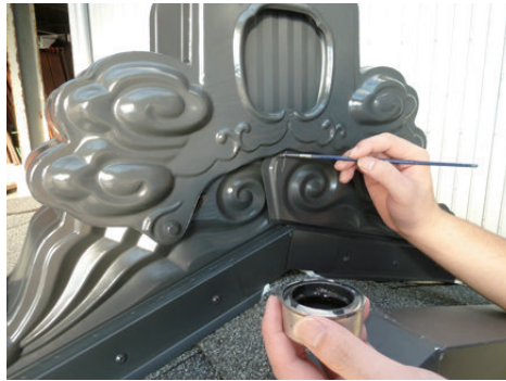
13. Paint any scratches from setting B-12 with the touch-up paint.