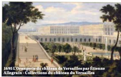
1695 L'Orangerie du château de Versailles par Étienne Allegrain - Collections du château de Versailles

Houstonian Sir Mark Haukohl's collection of 47 women artists who are challenging the notions of gender, nationhood, and the practice of photography itself are the focus of the upcoming must-see exhibit at the Brooklyn Museum. The prior success of In the Now: Gender and Nation in Europe, Selections from the Sir Mark Fehrs Haukohl Photography Collection occurred at the Los Angeles County Museum of Art in 2022. March 8–July 7. At BrooklynMuseum.org.