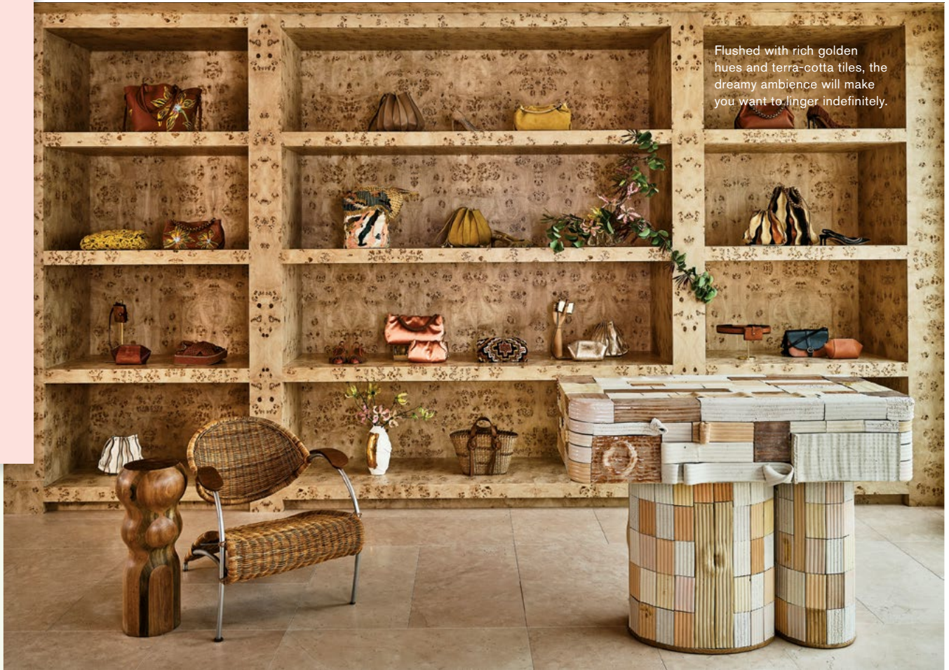
Flushed with rich golden hues and terra-cotta tiles, the dreamy ambience will make you want to linger indefinitely.

M anhattan-born Ulla Johnson unearthed her trademark design style by traveling around the globe. Now she has decided to leave a significant impact on California with a picturesque 3,000-sq.-ft., two-story flagship store in West Hollywood. Johnson has joined creative forces with a community of local designers — including interior design oracle Kelly Wearstler —