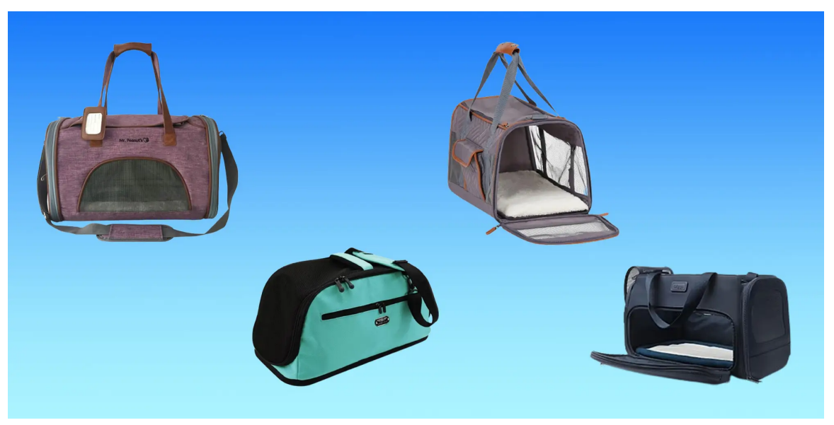
You'll need one of the best airline-friendly pet carriers to keep your cat safe and comfortable while flying.

Amazon; Sleepypod; Chewy; Diggs/Business Insider