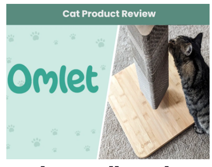
Omlet Cardboard Cat Scratching Post Review 2024: