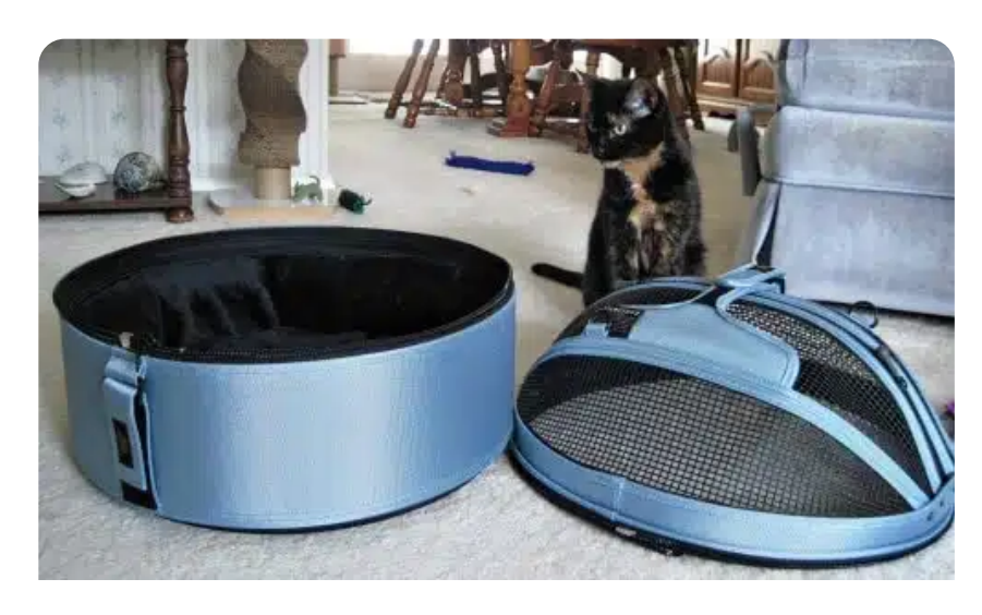
Allegra checking out the Sleepypod on arrival