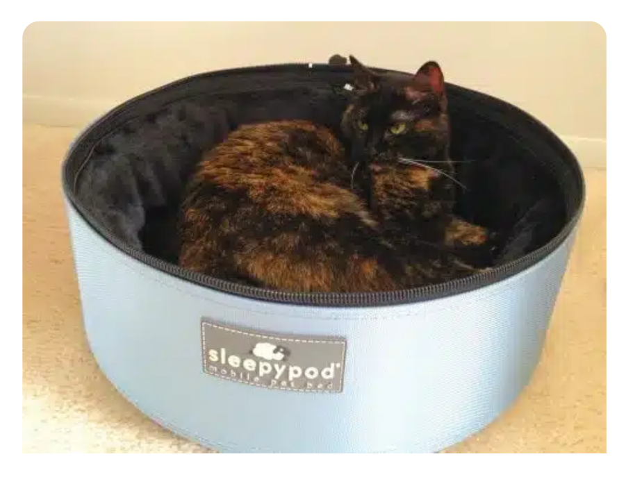
Ruby thinks the Sleepypod makes a great bed

zips away, so my patient does not have to be 'dragged' or 'dumped' out of a carrier that only opens to the front. Even better, I can often leave my patients sitting right in their own bed for most of the examination process."