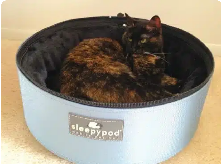
Ruby thinks the Sleepypod makes a great bed

zips away, so my patient does not have to be 'dragged' or 'dumped' out of a carrier that only opens to the front. Even better, I can often leave my patients sitting right in their own bed for most of the examination process."