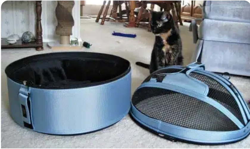
Allegra checking out the Sleepypod on arrival