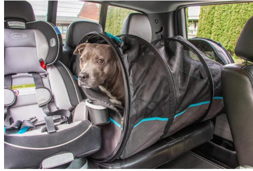
[Don't you love the look on his/her face?]