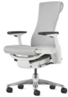
Embody Chair エンボディ チェア