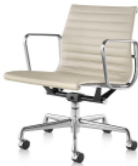
Eames Aluminum Management Chair イームズアルミナム マネジメントチェア