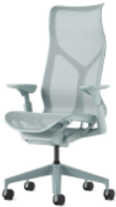
Cosm Chair コズム チェア