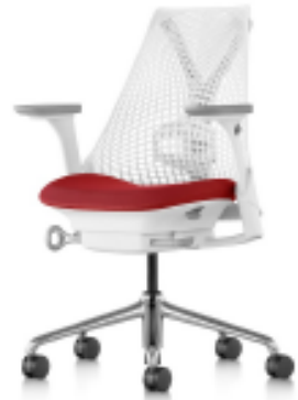
Sayl Chair セイル チェア