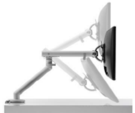
Flo Monitor Arm フロー モニターアーム

*Please check the website for the pricing and delivery lead-time.