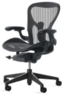
Aeron Chair アーロン チェア