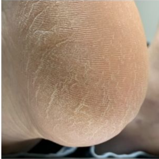
#3 DB Initial