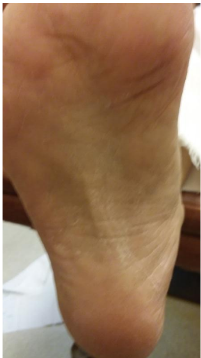
#6 RG initial