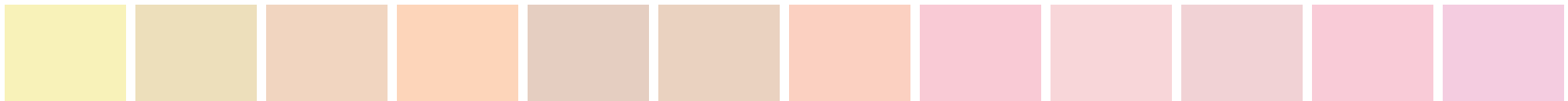
PANTONE 461 PC C:2 M:1 Y:33 K:1 PANTONE 468 PC C:2 M:7 Y:26 K:5 PANTONE 4685 PC C:1 M:14 Y:20 K:4 PANTONE 475 PC C:0 M:18 Y:25 K:0 PANTONE 4755 PC C:3 M:14 Y:16 K:7 PANTONE 482 PC C:2 M:13 Y:18 K:6 PANTONE 489 PC C:0 M:21 Y:19 K:0 PANTONE 496 PC C:0 M:25 Y:5 K:0 PANTONE 503 PC C:0 M:18 Y:6 K:1 PANTONE 5035 PC C:1 M:17 Y:7 K:3 PANTONE 510 PC C:0 M:25 Y:4 K:0 PANTONE 517 PC C:2 M:24 Y:0 K:0