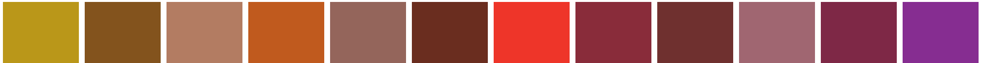
PANTONE 457 PC C:6 M:23 Y:97 K:26 PANTONE 464 PC C:13 M:51 Y:87 K:48 PANTONE 4645 PC C:8 M:43 Y:50 K:26 PANTONE 471 PC C:5 M:70 Y:97 K:20 PANTONE 4715 PC C:13 M:47 Y:43 K:38 PANTONE 478 PC C:19 M:75 Y:74 K:58 PANTONE 485 PC C:0 M:93 Y:95 K:0 PANTONE 492 PC C:12 M:84 Y:53 K:44 PANTONE 499 PC C:19 M:74 Y:58 K:56 PANTONE 4995 PC C:11 M:53 Y:25 K:33 PANTONE 506 PC C:14 M:83 Y:32 K:49 PANTONE 513 PC C:56 M:98 Y:0 K:0