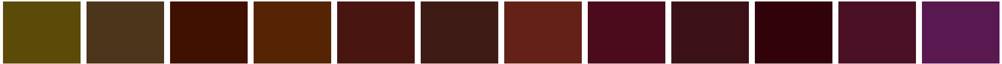
PANTONE 455 PC C:21 M:34 Y:93 K:66 PANTONE 462 PC C:28 M:48 Y:71 K:72 PANTONE 4625 PC C:29 M:78 Y:91 K:78 PANTONE 469 PC C:21 M:70 Y:92 K:70 PANTONE 4695 PC C:29 M:79 Y:71 K:73 PANTONE 476 PC C:32 M:67 Y:63 K:78 PANTONE 483 PC C:20 M:81 Y:76 K:61 PANTONE 490 PC C:29 M:85 Y:54 K:72 PANTONE 497 PC C:32 M:73 Y:52 K:80 PANTONE 4975 PC C:36 M:84 Y:59 K:83 PANTONE 504 PC C:30 M:82 Y:44 K:73 PANTONE 511 PC C:46 M:90 Y:12 K:50