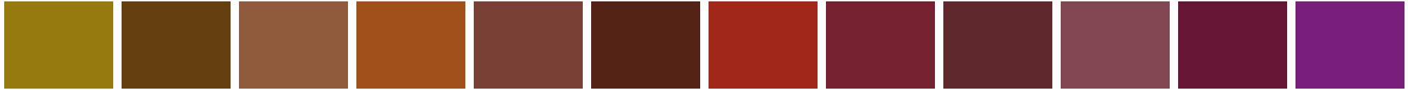
PANTONE 456 PC C:9 M:25 Y:98 K:41 PANTONE 463 PC C:17 M:52 Y:87 K:63 PANTONE 4635 PC C:13 M:53 Y:68 K:40 PANTONE 470 PC C:8 M:68 Y:94 K:34 PANTONE 4705 PC C:17 M:64 Y:60 K:51 PANTONE 477 PC C:25 M:75 Y:73 K:68 PANTONE 484 PC C:8 M:91 Y:92 K:33 PANTONE 491 PC C:15 M:85 Y:53 K:54 PANTONE 498 PC C:23 M:74 Y:54 K:63 PANTONE 4985 PC C:16 M:63 Y:32 K:47 PANTONE 505 PC C:20 M:86 Y:38 K:62 PANTONE 512 PC C:55 M:99 Y:3 K:16