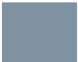
PANTONE 7544 PC C:33 M:14 Y:11 K:31