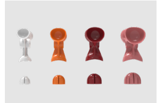
Juice extraction kits