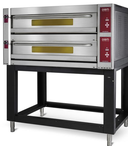
VALIDOEVO1235LBEM (on stand)