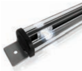
Optimax Pro 24 LED